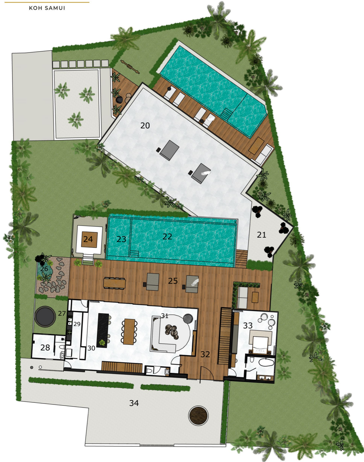
FLOORPLAN THIRD FLOOR