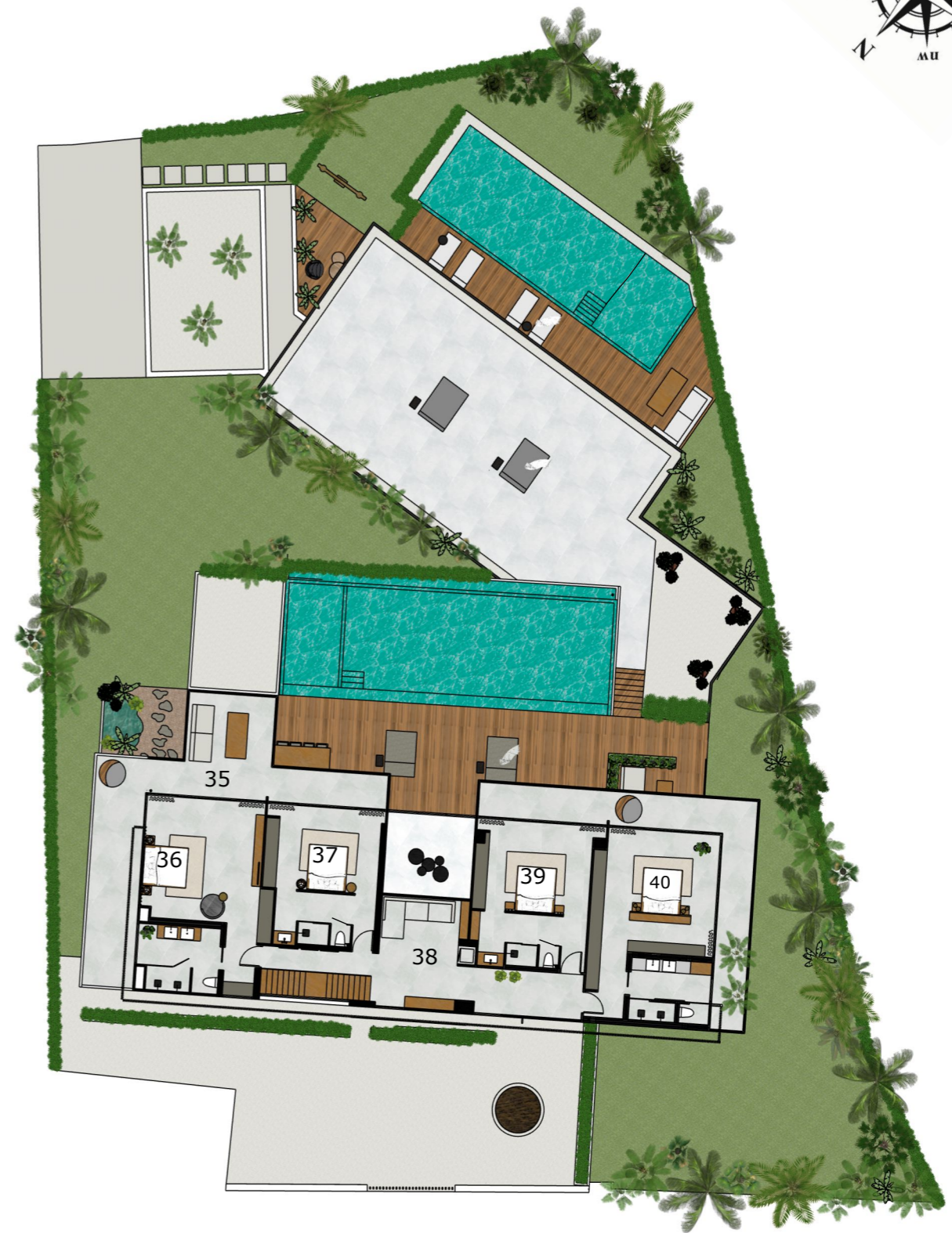
FLOORPLAN FOURTH FLOOR