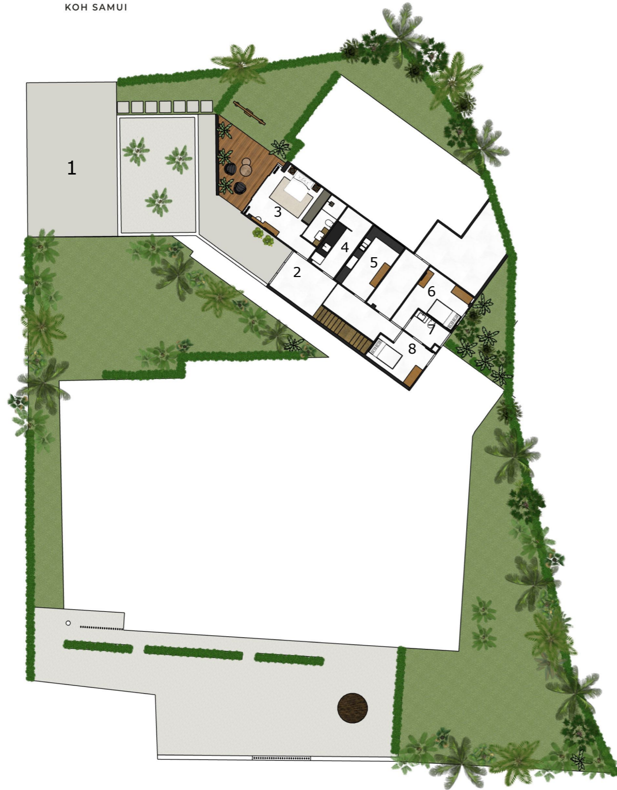
FLOORPLAN FIRST FLOOR