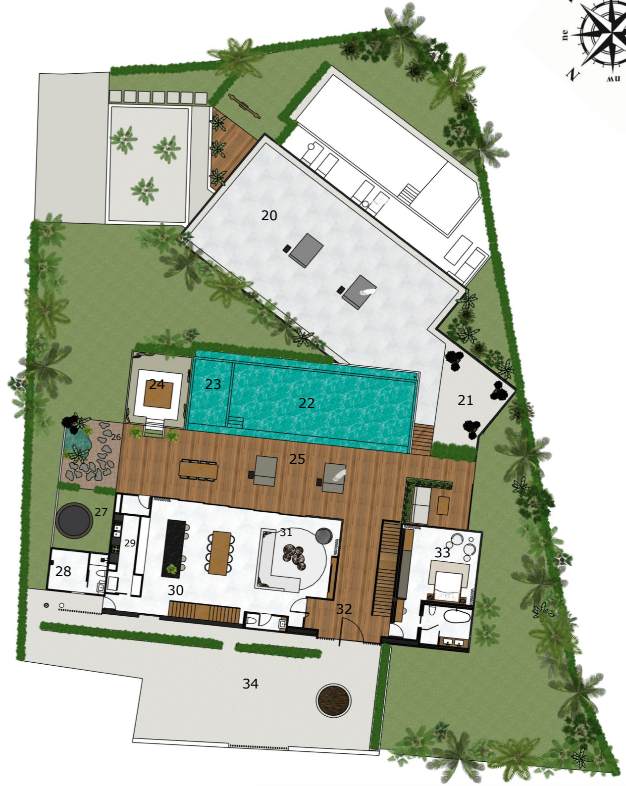
FLOORPLAN MAIN FLOOR