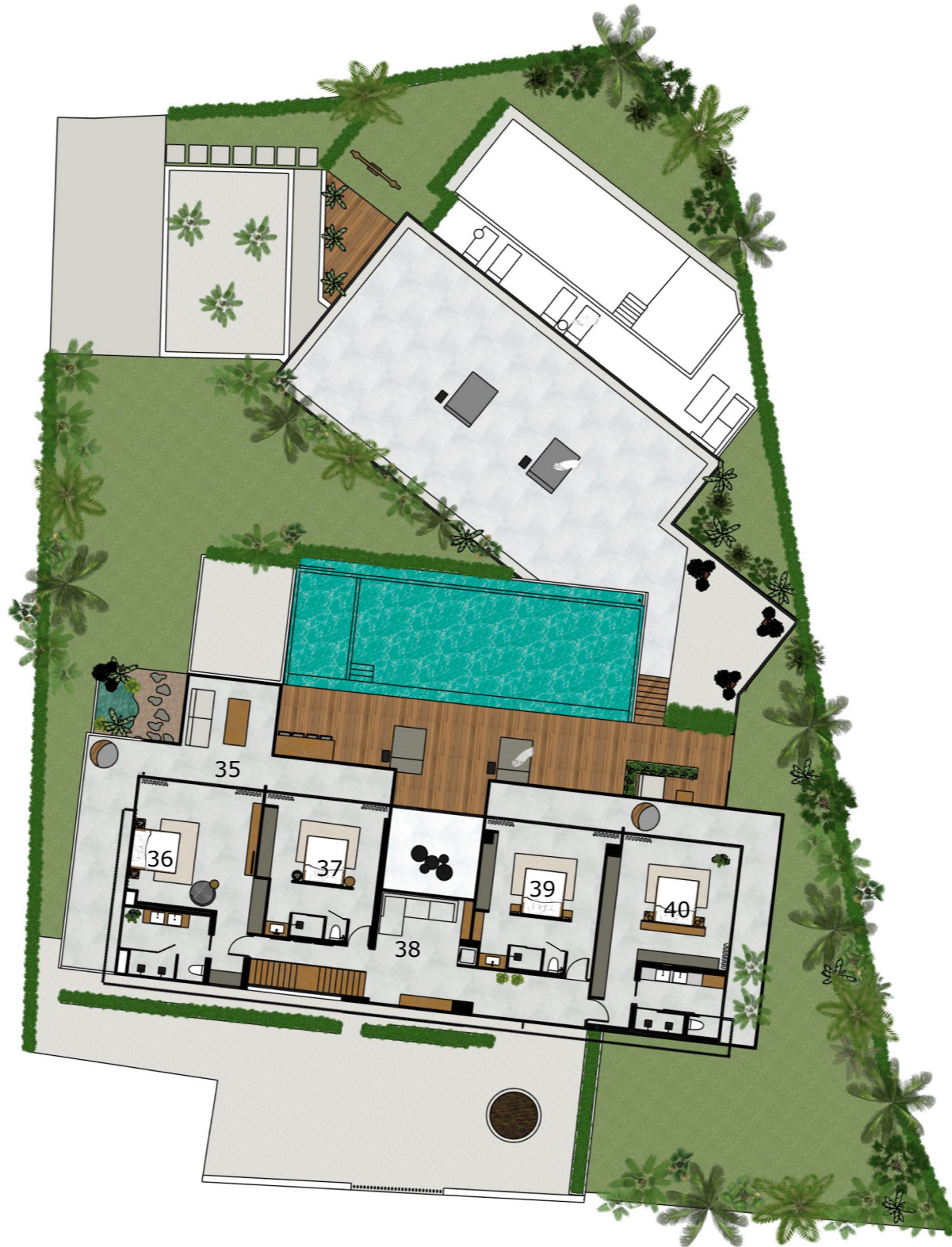
FLOORPLAN UPPER FLOOR

35 Lounge terrace 36 The Rose, presidential bedroom 37 Violet, bedroom