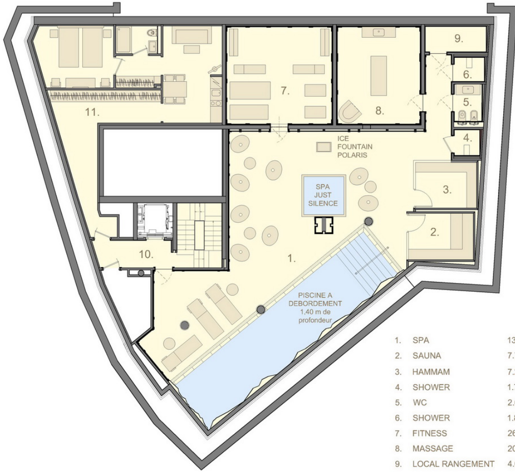
-2 level layout.