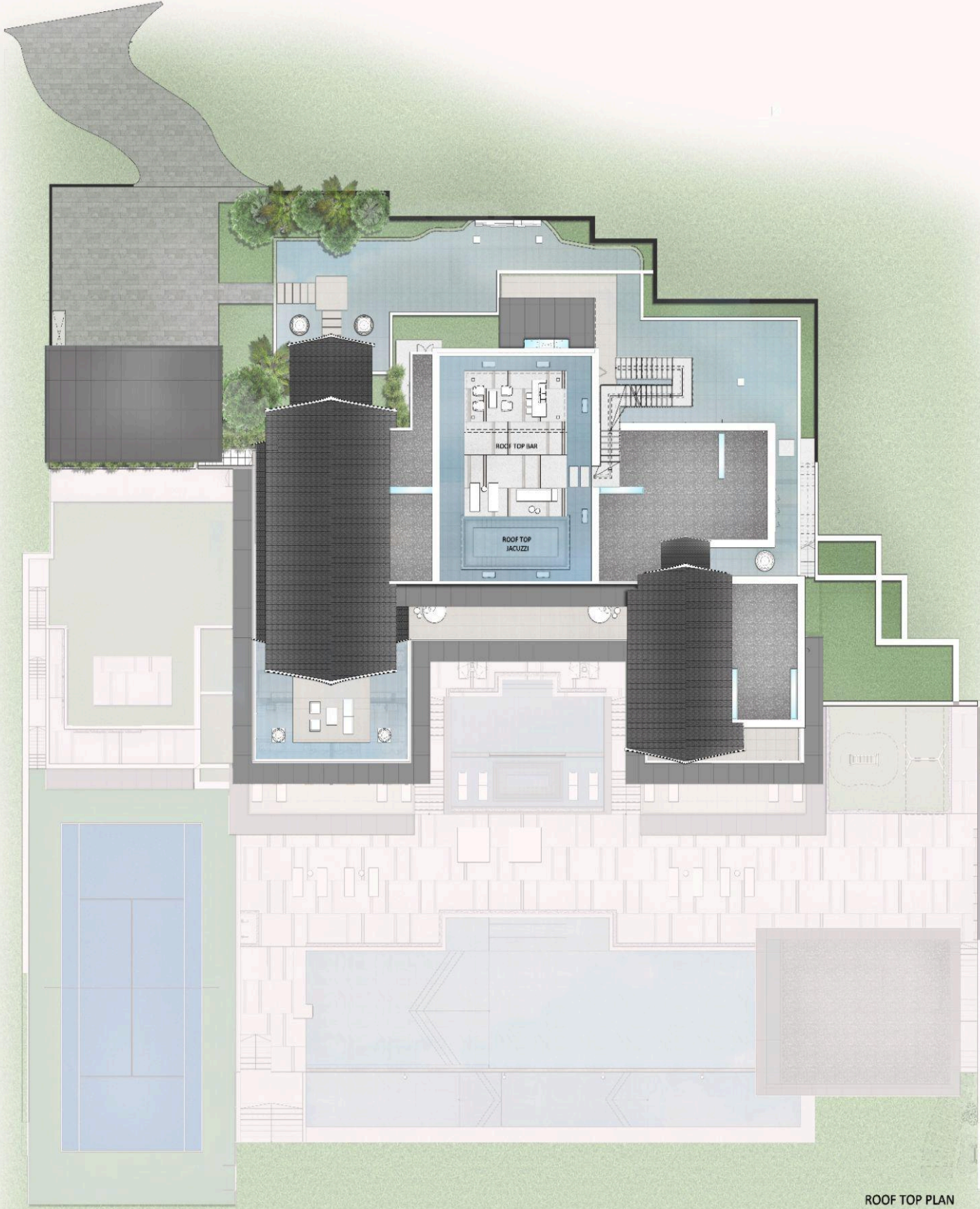
ROOF TOP PLAN