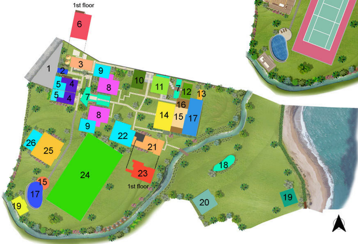
Villa Ombak Laut Key Plan