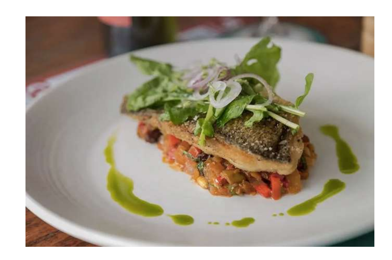
La Lucciola Bali