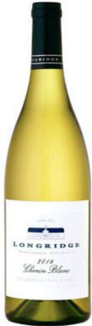
Longridge South Africa Chenin Blanc 2014, Alc. 13%

Green sweet melon, rich citrus, lime and perfume greets you on the nose while hints of nuttyness on the palate ends in a crisp fresh finish.