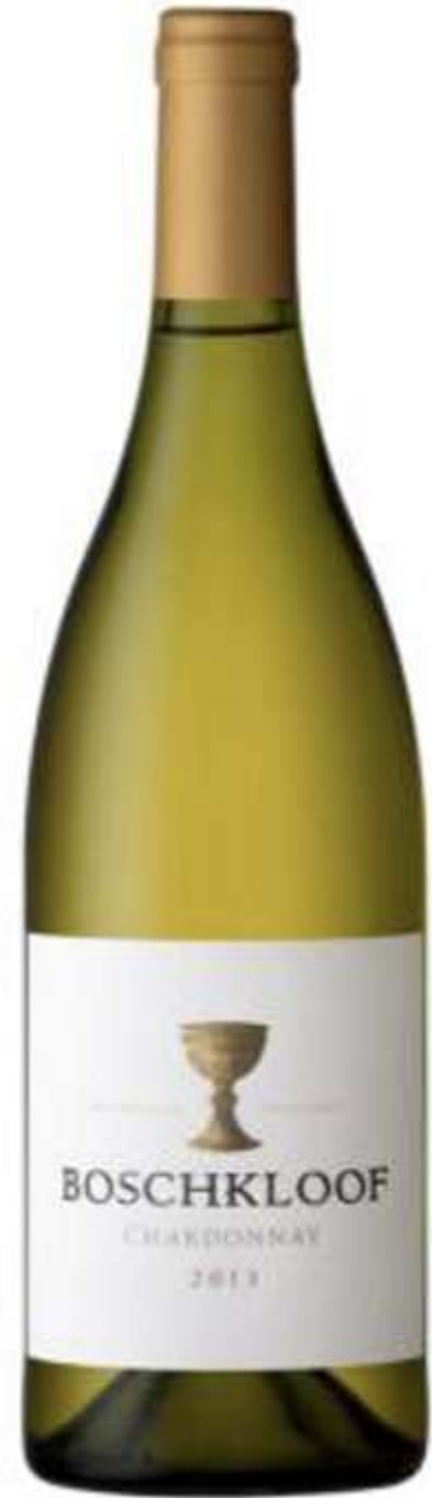
Boschkloof South Africa Chardonnay 2013, Alc. 13.5%

A wine created in a rich complex style with citrus, lime and hints of apricot flavours. Elegant aroma shows citrus characters, integrated with subtle hints of oak that adds to the complexity. Good fruit and balance with long lingering finish. Enjoy now or benefit from cellaring.