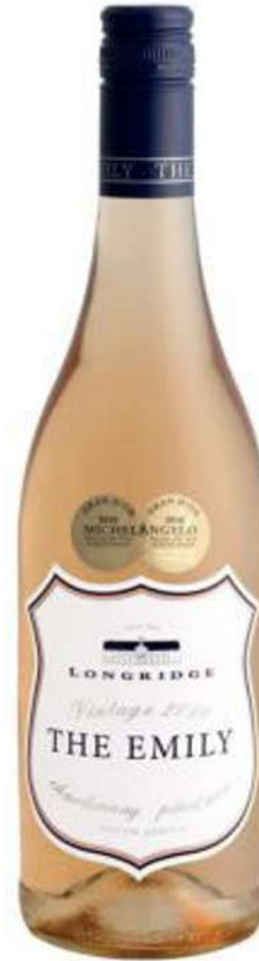
Longridge South Africa Chardonnay, Pinot Noir 2015, Alc. 13.5%

A fresh wine, bursting with aromas of ripe guava, pineapple, kiwi, fresh citrus and kumquat preserve, green apple and ending with a well-balanced acidity and a lingering finish.