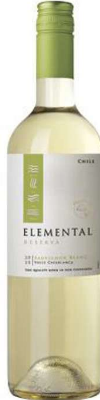
Elemental Chile Sauvignon Blanc 2018, Alc. 12%

Clean and translucent light yellow in color. The complex nose presents citrusy and grapefruit and lime notes with a subtle touch of white pepper and delicate herbs. The smooth palate bursts with freshness balanced by good volume and persistence.